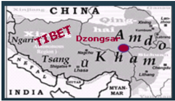
Dzongsar, Derge County

Dzongsar area is between 3400m and 4000m high. This is a beautiful authentic valley. 30 villages, 6000 persons, 70 % of farmers and 30 % of nomads.